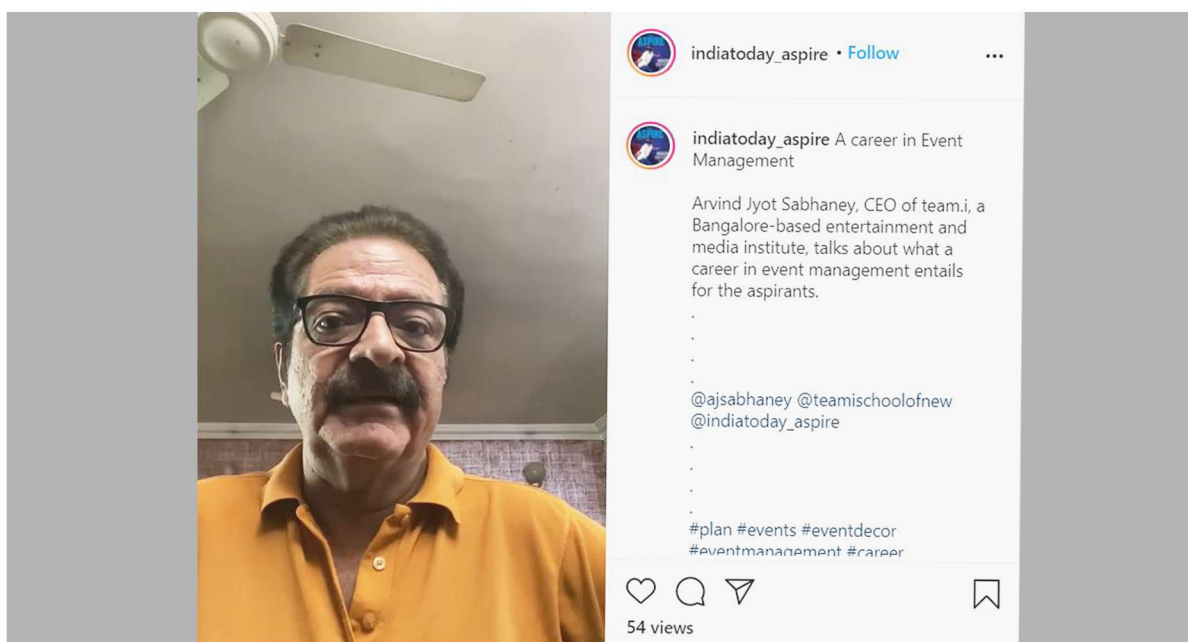
India Today- Aspire Video detailing what a career in event management entails for the aspirants